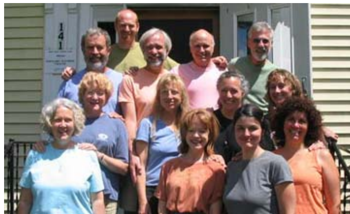
Members of Portland Playback Theater Company

Have you ever been locked in “a pecking order” somewhere? Portland Playback Theater Company invites you to share your story for the actors to play back (or watch somebody else’s story) at 7:30 pm on Feb. 6 at First Parish Church, Congress at Temple St., Portland, ME, when their First Friday Performance Series continues with CHAIN OF COMMAND . ($5 donation suggested – no reservations needed.) Also the troupe returns to the USM Portland campus on Feb. 12 at 7 pm to play back stories of the bliss and hurt of love! This will be at Hannaford Lecture Hall, Abromson Community Education Center, and tickets can be purchased by calling (207) 780-5900, online at www.usm.maine.edu/cce/evenings.htm , or at the door.