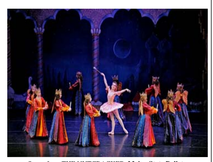
Scene from THE NUTCRACKER, Maine State Ballet .

Cast & Crew is published bimonthly. Articles, photographs, and news are welcomed.