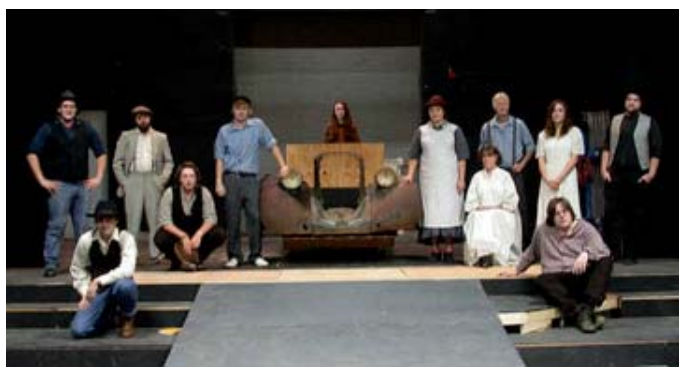
Cast of THE GRAPES OF WRATH, U Maine Farmington October production.