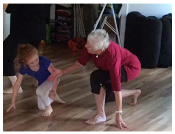
Commemorating THE TWENTY in Dance (rehearsal photo)