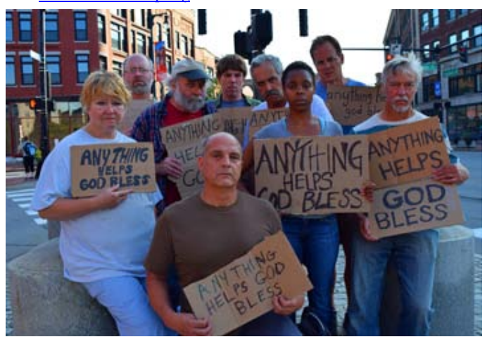
ANYTHING HELPS GOD BLESS, Snowlion Repertory Company

3 at Portland Ballet Studio Theater at 7:30 pm. Call (207) 518-9305 or visit www.snowlionrep.org.