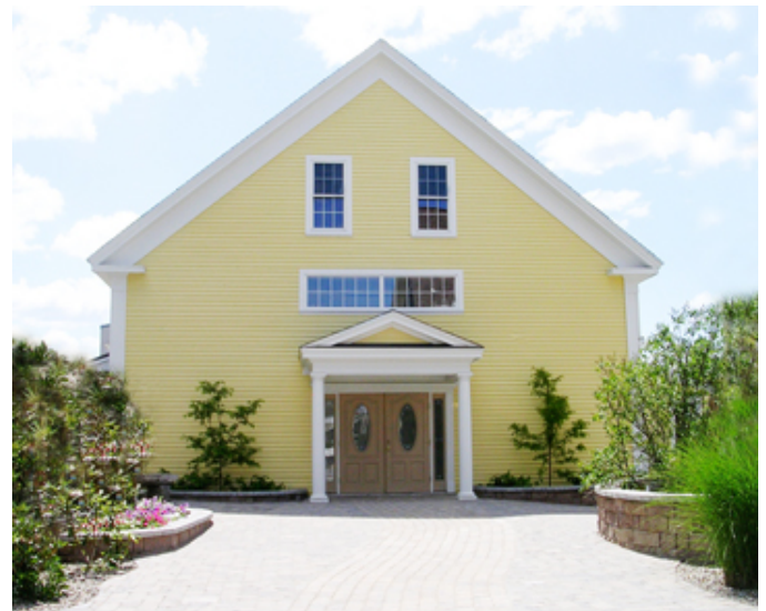
Little Theatre at Nasson Community Center

What lies ahead for the Little Theatre at Nasson?