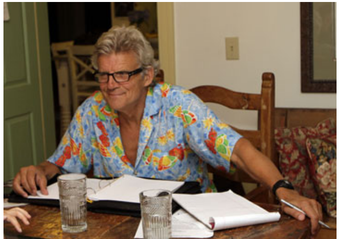
Playwright/Director Ernest Thompson