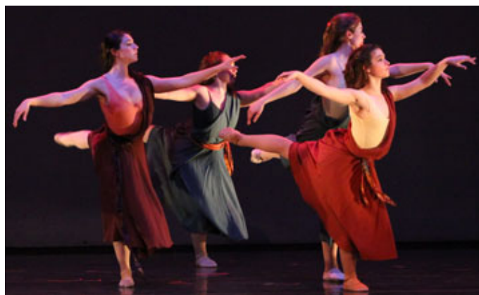
MORNING WALK , Robinson Ballet Live 2011 .