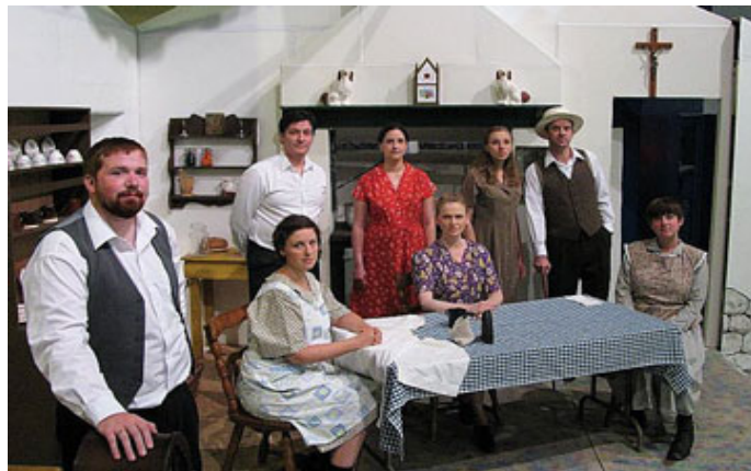
Cast of DANCING AT LUGHNASA , The Majestic Theatre August production

At the Winnepesaukee Playhouse in Laconia, NH, A. R. Gurney's LOVE LETTERS will take the stage Oct. 8 – 10. Call (603) 366-7377 or visit www.winnipplayhouse.com .