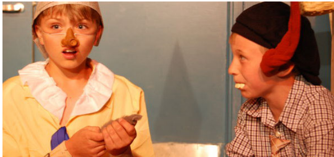
Young Actors in PINOCCHIO, CMTM August 2010 production.