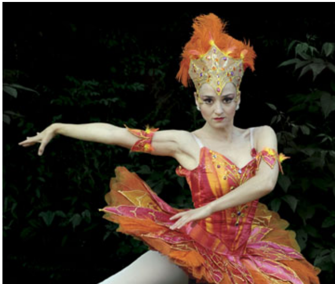
THE FIREBIRD, Maine State Ballet . Photo by C. C. Church