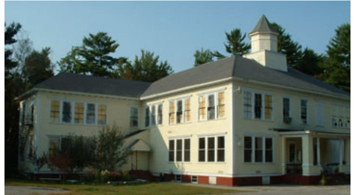
Schoolhouse Arts Center

(the new owners of an old farmhouse meet up with previous owners) in August.