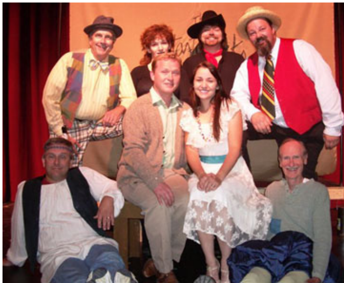
The Cast of THE FANTASTICKS, L/A Community Little Theatre.

Musically accompanied dinner theater continues at Carousel Music Theater in Boothbay Harbor, ME, through October 8, with AS TIME GOES BY. Call (207) 633-5297 or 800-757-5297 (ME only).