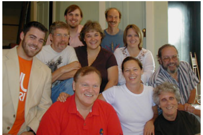
The Cast of SOMETHING'S AFOOT, Oxford Hills Music and Performing Arts Association