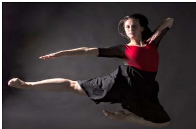
Ballet Bloom Project, Mechanics' Hall First Friday May 2019