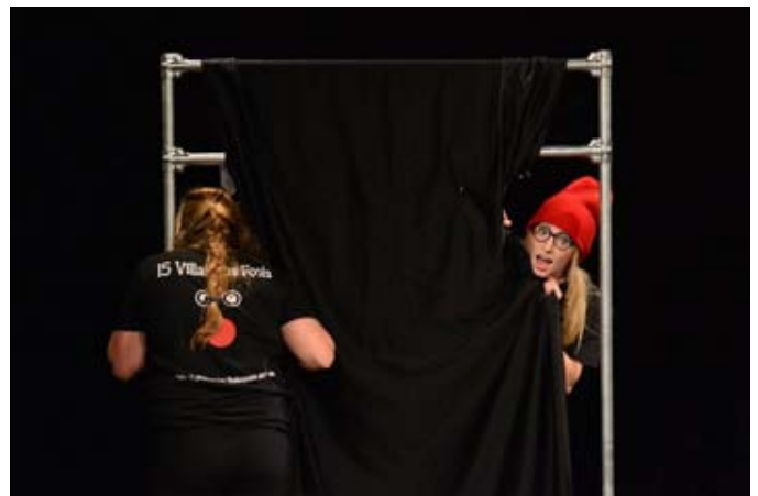
15 VILLANOUS FOOLS, The 601 Theatre Company: PortFringe, PSC Studio June 21, 24, 25