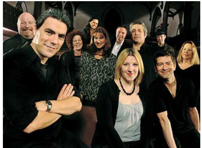
Cast of The Who's TOMMY , Studio Theatre of Bath May production