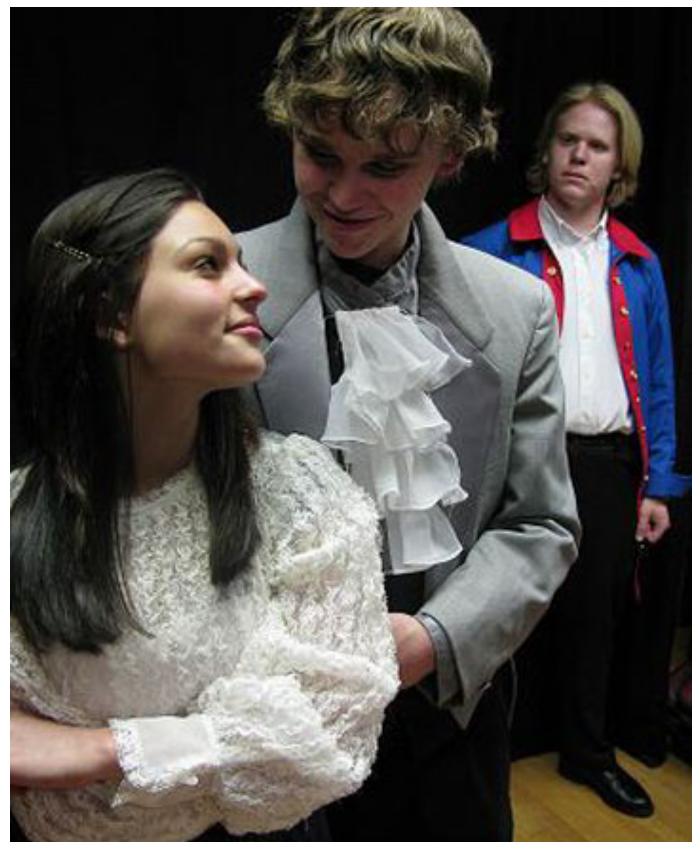
LES MISERABLES (School Edition), The Majestic Theatre Youth May production

Children's Theater reigns at the Palace Theatre in Manchester, NH, where shows on the 1 st day will be at 10 am & 6:30 pm and on the 2 nd day at 10 am: CINDERELLA Jul. 7 & 8; WILLY WONKA Jul. 14 & 15; LITTLE MERMAID Jul. 21 & 22; CHARLOTTE'S WEB Jul. 28 & 29. Call (603) 668-5588.