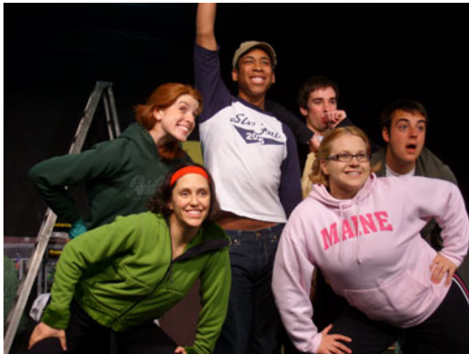
YOU'RE A GOOD MAN, CHARLIE BROWN Rehearsal Photo, Vacationland Theater:

years. His acting credits include Tom Joad in THE GRAPES OF WRATH , Benvolio in ROMEO AND JULIET , Martini in ONE FLEW OVER THE CUCKOO'S NEST , and MacDuff in MACBETH , as well as Showtime's WEEDS .