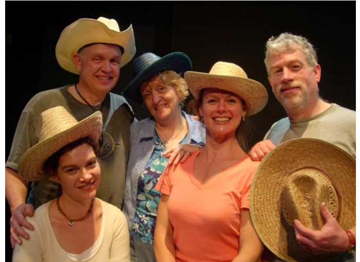
Cast of DAS BARBECU , Heartwood Regional Theater Company