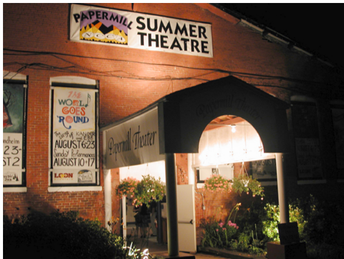
Papermill Theatre

“This complex houses just what we need for performance; there’s no scene or costume shop, etc. We’re currently having some testing done for the old whitewater treatment plant behind us, so hopefully we can acquire that from the town. That’s where we would build our annex building for the back end stuff: costume shop, set shop, administrative offices, rehearsal hall. It’s going to take the resort developer several years to get the large complex going. In the meantime, the entire old papermill building that includes the current theater is going to be demolished, leveled, next spring or the spring after. So our plan is to build this annex building with the rehearsal stage and tack onto the outside a performance tent with 200 seats. This would be a heated and air-conditioned tent that would be usable year round. It’s even rated for snowload, but it’s our intention to run fall programming for foliage season. We haven’t decided if we’ll produce our own shows for that time frame or bring in shows or events. It’ll probably be a mix, not strictly musical theater, but the summer format would stay intact because that’s what the summer crowds expect and like.”