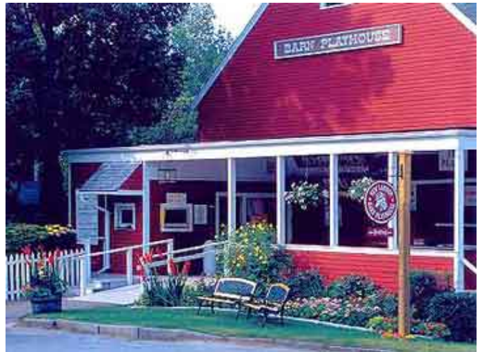
New London Barn Playhouse