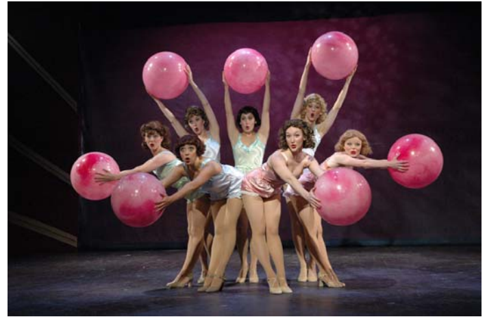
42 nd STREET, 2006 season.