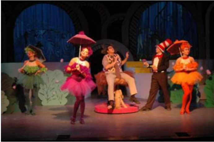
SEUSSICAL, 2007 season.