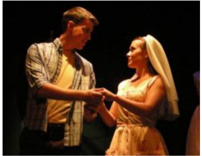
WEST SIDE STORY, 2007 season.

For paid/primary actors , Papermill Theatre attends Auditions at NETC (mid-March 2009 in Massachusetts, application deadline in January, non-Equity), Straw Hat (late March 2009 in NY, application deadline in February, non-Equity), and NH Professional Theater Companies (both Equity & non-Equity, February 2009, in the fall check www.nh.gov/nhculture/ )