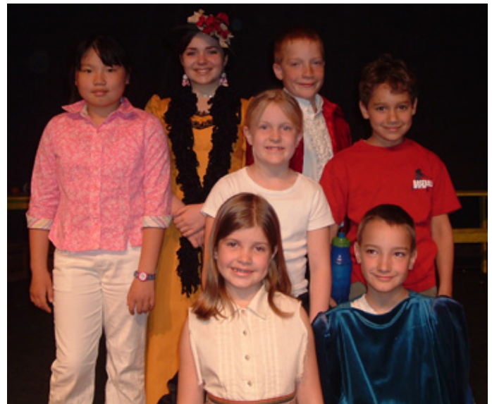
The cast of CINDERELLA, CINDERELLA... Schoolhouse Arts Center ½ Pint Players