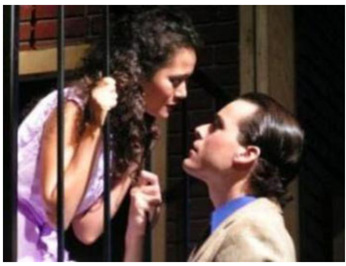
WEST SIDE STORY 2005