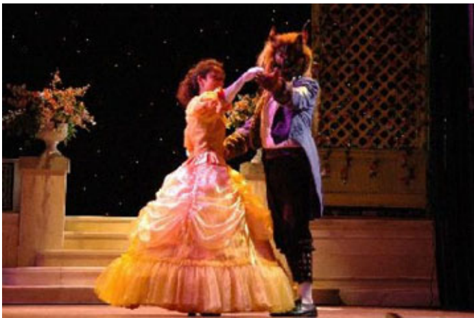
BEAUTY AND THE BEAST 2005