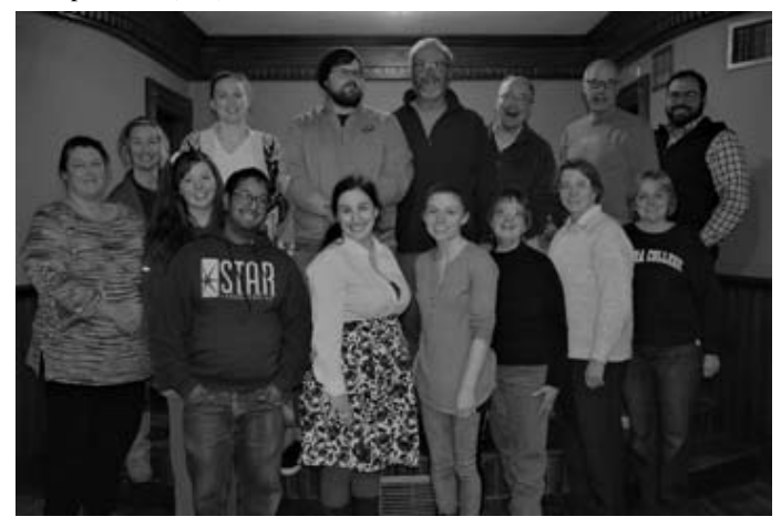
Cast of WHEN RADIO WAS KING, Monmouth Community Players

The line-up of Portland Ovations offerings includes the following, all at Merrill Auditorium except when indicated otherwise: the national tour of LEGALLY BLONDE The Musical Feb. 13 & 14 at 7:30 pm; the national tour of THE SOUND OF MUSIC Mar. 1 at 7 pm, Mar. 2 at 12:30 & 6:30 pm; Dreamers' Circus Mar. 28 at 7:30 pm at USM's Hannaford Hall in Portland; Les Ballets Trockadero de Monte Carlo Mar. 29 at 8 pm; and Alvin Ailey American Dance Theater May 1 at 7:30 pm. Call (207) 842-0800.