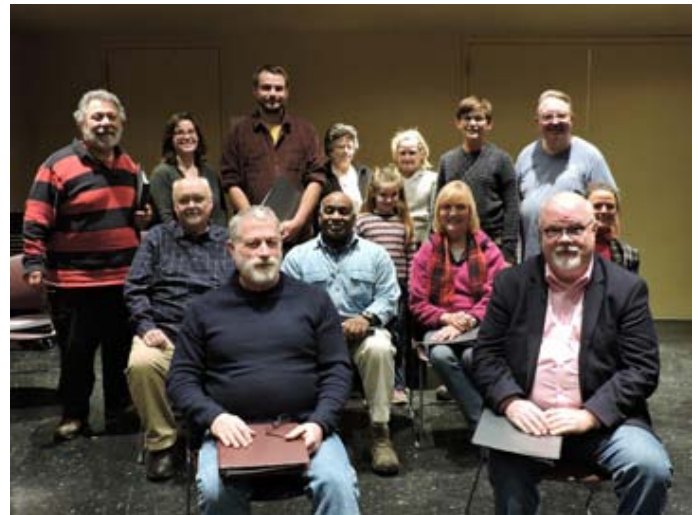
The Cast of A CHRISTMAS CAROL, River Company December Staged Reading