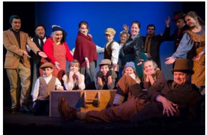
The Cast of SCROOGE, Chocolate Church Arts Center December production