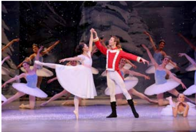
A Scene from THE NUTCRACKER, Bossov Ballet Theatre