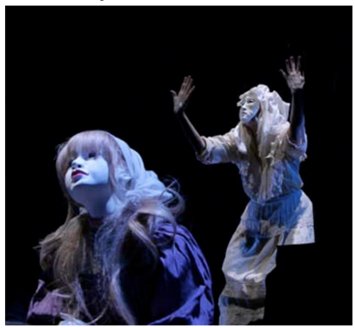
the little match girl passion, Figures of Speech Theatre : Little Match Girl and Grandmother.

At the Rochester Opera House , 31 Wakefield St., Rochester, NH, THE MIRACLE WORKER takes the stage Mar. 31 – Apr. 10, Thurs. & Fri. at 7:30, Sat. at 2 & 7:30, Sun. at 2. Call (603) 335-1992 or visit <a href="https://www.rochesteroperahouse.com">www.rochesteroperahouse.com</a>. The ROH January show was CHICAGO, running Jan. 15 – 31.