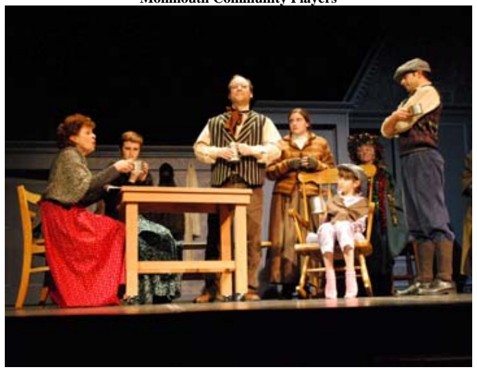
A CHRISTMAS CAROL, Everyman Repertory Theatre December Production: The Cratchit Family