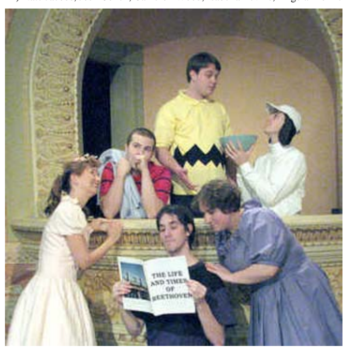
Cast of YOU'RE A GOOD MAN, CHARLIE BROWN, Monmouth Community Players