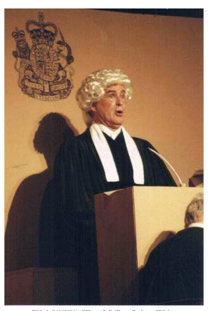
\begin{array}{c} {\rm TRIAL~BY~JURY,~\textbf{Gilbert~\&~Sullivan~Society~of~Maine}}\\ 2006~{\rm production:}~~{\rm The~Judge} \end{array}