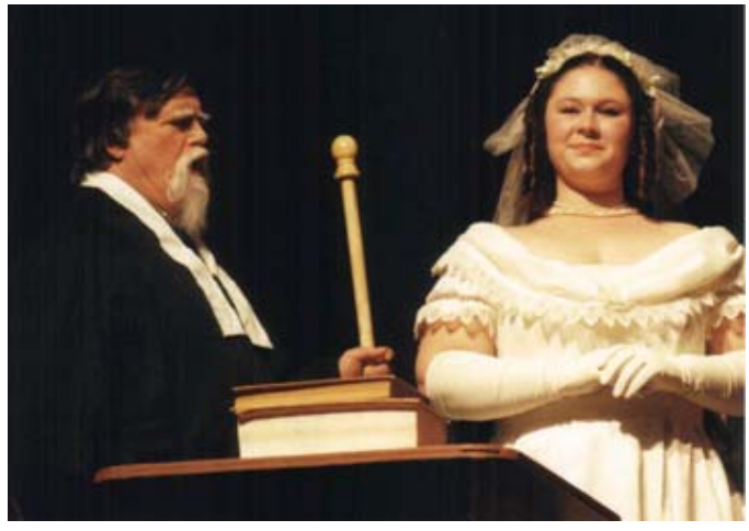
TRIAL BY JURY, Gilbert & Sullivan Society of Maine 2006 production: Counsel and Plaintiff

The Gilbert and Sullivan Society of Maine is once again busy rehearsing their annual winter production, but this year there is a twist. The Society went through their usual process late in 2011 to select the next opera in the Gilbert and Sullivan collection to perform in 2012. However, 2012 marks the 35<sup>th</sup> anniversary of the performing group originally formed in 1977 to raise funds for the Hancock County Auditorium, now known as The Grand in Ellsworth. To commemorate the occasion, the Society decided to perform the short opera TRIAL BY JURY, followed by a collection of numbers from all of the operas performed over the history of the Society and call it A G & S Musicale . Many past performers will return to reprise their most notable scenes from earlier performances over the years, as many in the audience will remember.