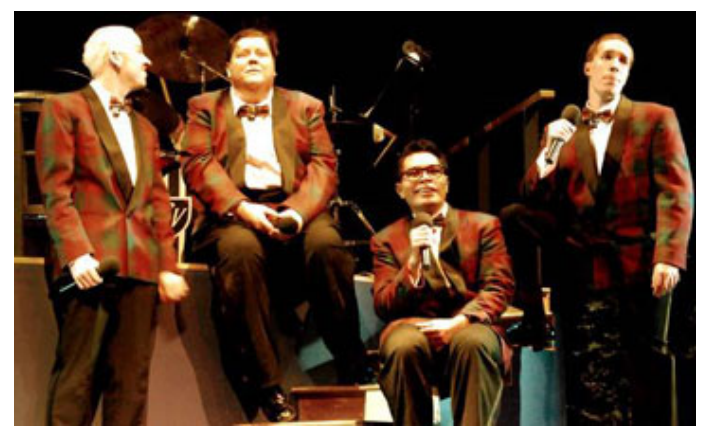
The Cast of PLAID TIDINGS, Penobscot Theatre December production.

ring! Complications arise when both fall in love with Louise, the assistant director. Visit <a href="www.tenbuckstheatre.com">www.tenbuckstheatre.com</a> or call (207) 884-1030.