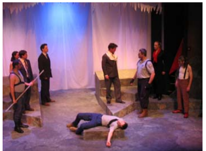
TITUS ANDRONICUS, Two Lights Theatre Ensemble