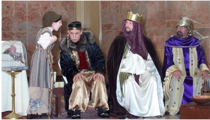
AM AHL AND THE NIGHT VISITORS, Seaglass Performing Arts: Amahl and The Three Kings