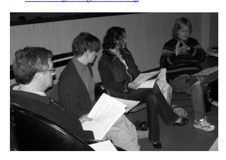
Rehearsal Photo: King's Bridge Theatre

sculpture, set design and costume design; and a monthly concert series to showcase local artists. Also in the planning stages is "King's Bridge Kids: a Young Persons' Theatre." For more information, visit www.kingsbridgetheatre.org.