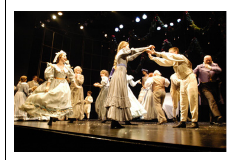
A CHRISTMAS CAROL, Portland Stage Company: Fezziwig's Ball.