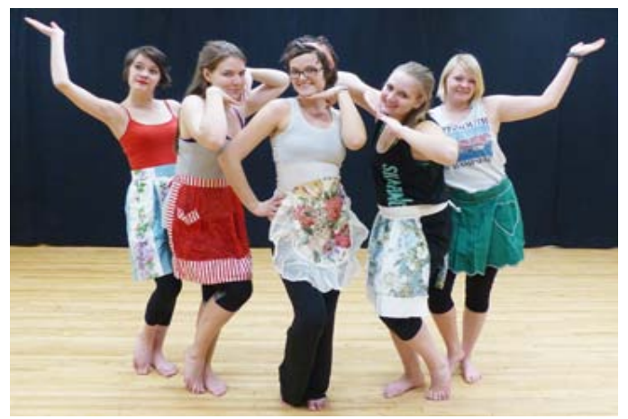
A Number from Dance USM!, University of Southern Maine