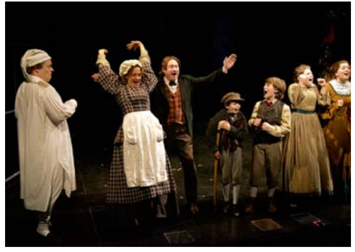
A CHRISTMAS CAROL, Portland Stage Company 2012 : Scrooge sees the Cratchit family Christmas