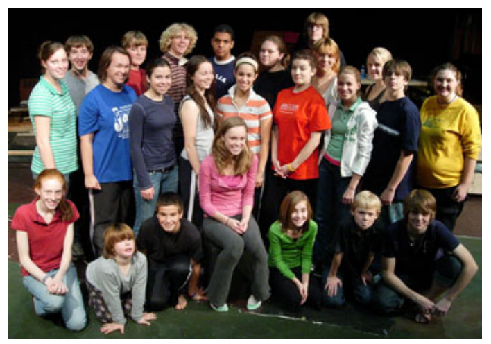
The Cast of THE SNOW MAIDEN: A Russian Folktale: Heartwood Regional Theater Company