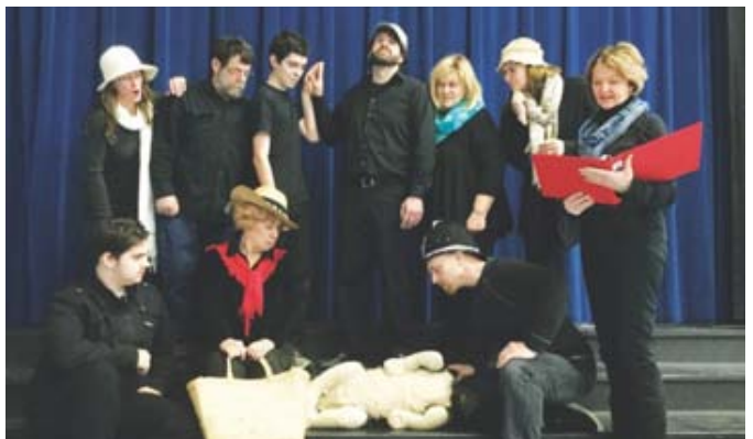
The Cast of THE CURIOUS INCIDENT OF THE DOG IN THE NIGHT-TIME, Schoodic Arts Meetinghouse Theatre Lab May production