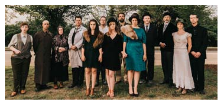
The Cast of THREE SISTERS, Fenix Theatre Company