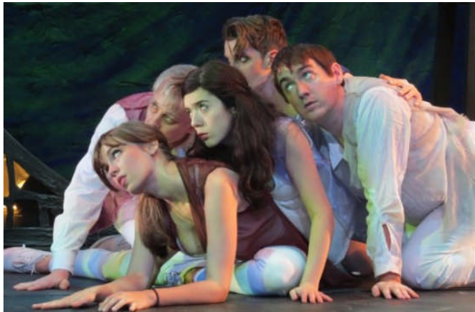
A Scene from A MIDSUMMER NIGHT'S DREAM , Winnepesaukee Playhouse July production

In New Hampshire, JAMES AND THE GIANT PEACH JR. is on stage at the Capitol Center for the Arts , 44 So. Main St., Concord, NH, July 29 & 30 at 7 pm. Next will be ALADDIN on Aug. 2 at 11 am; THE LITTLE MERMAID on Aug. 9 at 11 am; and then a screening of AUDIENCE with Helen Mirren on Sep. 2 at 6 pm. Visit www.ccanh.com or call (603) 225-1111.