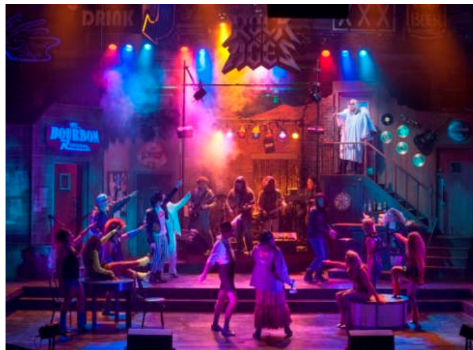
A Scene from ROCK OF AGES , Penobscot Theatre Company's June production

Maine State Ballet , 348 US Rte 1, Falmouth, ME, will dance CAN-CAN PARISIEN and RAYMONDA (excerpts from the ballet set to music by Glazunov) in their theater on Aug. 11, 12, 18, & 19 at 7; Aug. 13 & 20 at 2 & 7 pm. Call (207) 781-7MSB or visit www.mainestateballet.org .