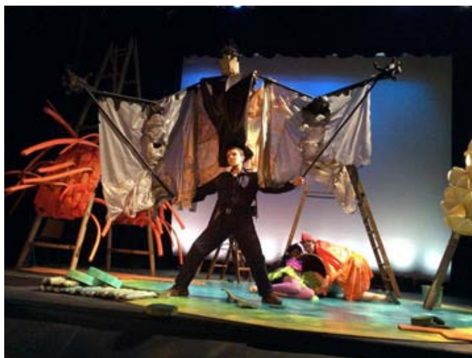
A Scene from THE SELFISH SHELLFISH , Deertrees Theatre July production