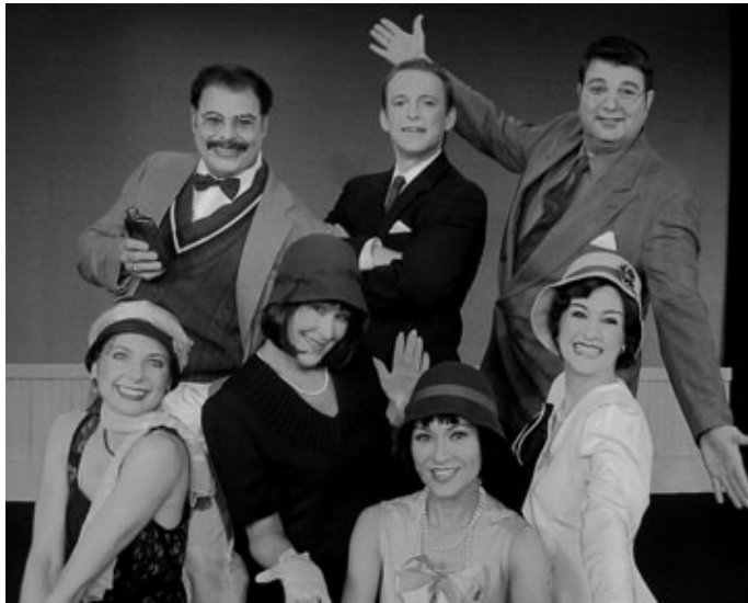
Cast of THE IT GIRL, The Originals