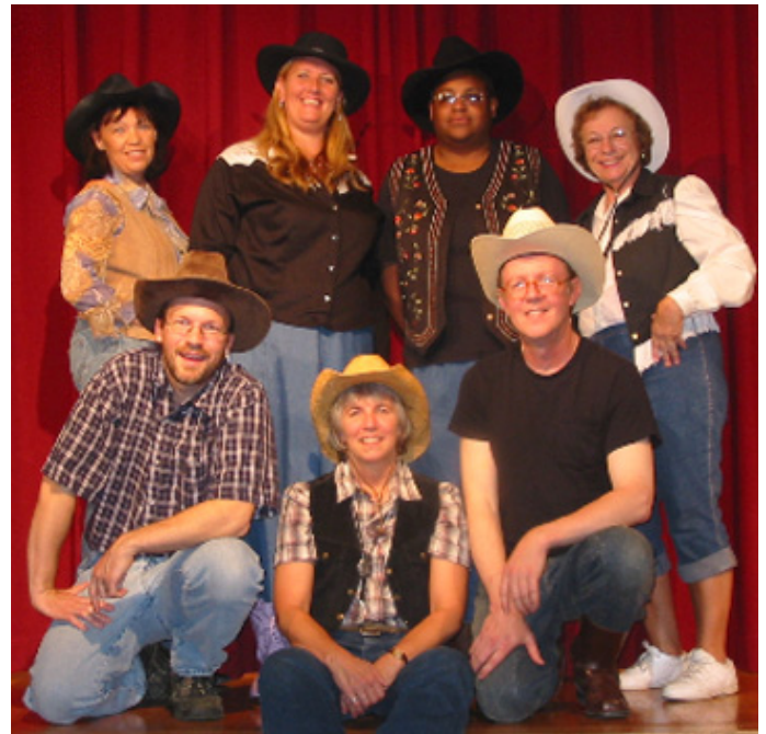
Cast of OLDE-TYME COUNTRY MUSIC SINGALONG , Reindeer Theatre Company