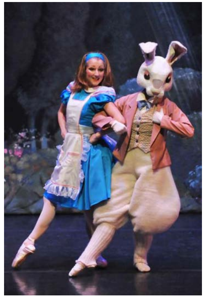
ALICE IN WONDERLAND, Maine State Ballet

The final screenings of the Metropolitan Opera Live in HD for the 2017-18 season are: COSI FAN TUTTE ("So do they all") by Mozart on Mar. 31 at 12:55 pm; LUISA MILLER by Verdi on Apr. 14 at 12:30 pm; and CENDRILLON (Cinderella) by Massenet on Apr. 28 at 12:55 pm. Here is the contact information for venues offering this series (be sure to check with your local venue for the times and also because some will have changes in dates in order to fit in with their Ellsworth, other scheduled events):The Grand, ME. www.grandonline.org, (207) 667-9500; The Strand, Rockland, ME, (207) 594-0070, www.rocklandstrand.com; Brunswick 10 Cinema, Cook's Corner, Brunswick, ME, (207) 798-4505; Lincoln Theater, Damariscotta, ME, (207) 563-3434, www.atthelincoln.org; Collins Center for the Arts, Orono, ME, (207) 581-1755, www.collinscenterforthearts.com; Eastman Performing Arts Center, Fryeburg, ME, (207) 935-9232, www.fryeburgacademy.org; Waterville Opera House, 1 Common St., Waterville, ME, (207) 873-7000, www.operahouse.org; Capitol Center for the Arts, Concord, NH, www.ccanh.com, (603) 225-1111; The Music Hall, Portsmouth, NH, www.themusichall.org, (603) 436-2400.