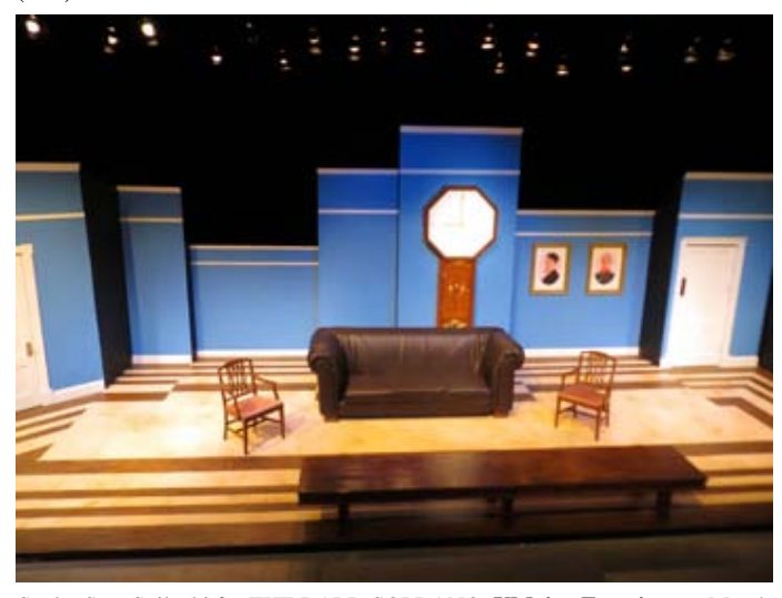
Set by Stan Spilecki for THE BALD SOPRANO, UMaine Farmington March production (The table is built to take the weight of the entire cast and will be placed in the lobby for seating after the show closes.)

pus, Bangor, ME, on Apr. 22 with performances at 5 & 8 pm. Call (207) 941-7888.