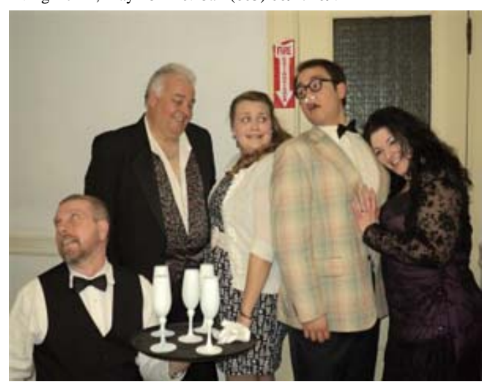
Cast of SUITEHEARTS, Majestic Theatre February production