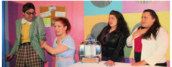
Cast of SUDS, The Majestic Theatre February production

Enjoy dinner/dessert theater at The Majestic Theatre , 281 Cartier St., Manchester, NH, which offers FOREVER PLAID Apr. 9 – 11 and MURDER'S IN THE HEIR May 7 – 9. Visit www.majestictheatre.net .