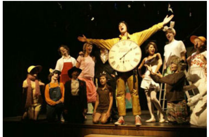
JUST A MATTER OF TIME , Boothbay Playhouse Aug. 2007