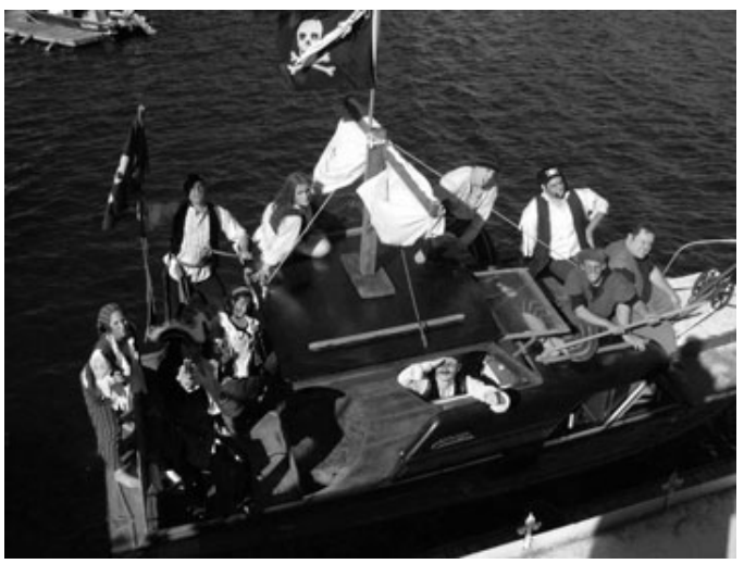
Pirates, Encore at the Point

there are seats unsold the week of the show. We'll let it be known through an "email blast" to get the word out each week this happens.