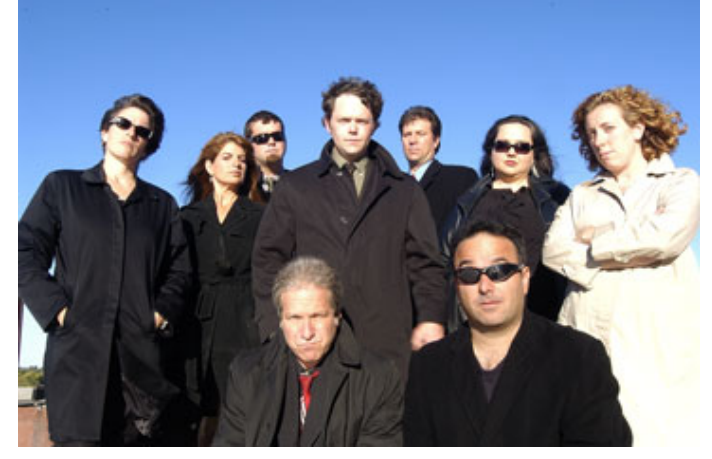
Biddeford City Theater CIA (Comedy Improv Alliance)