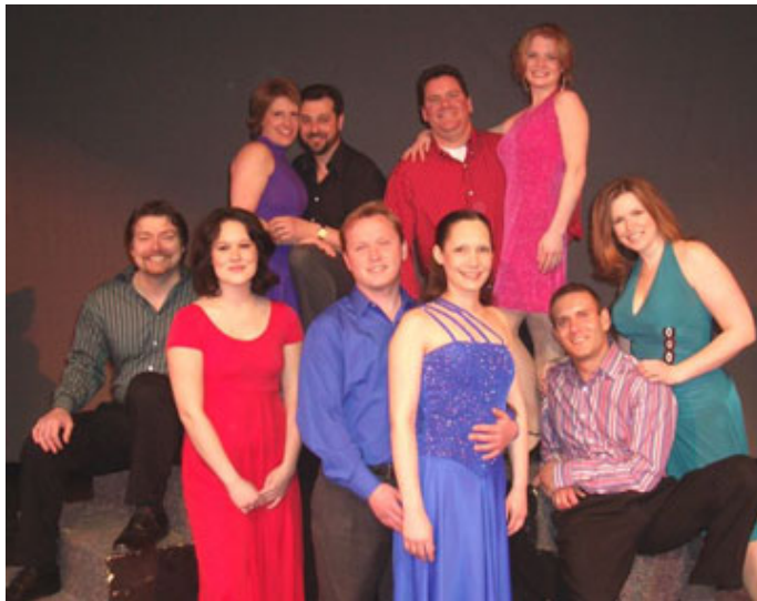
Cast of LOVE CHANGES EVERYTHING: The Music of Andrew Lloyd Webber, L/A Community Little Theatre.