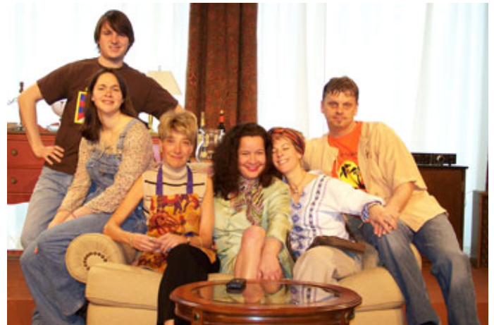
THE SISTERS ROSENSWEIG (partial) cast, Freeport Community Players .