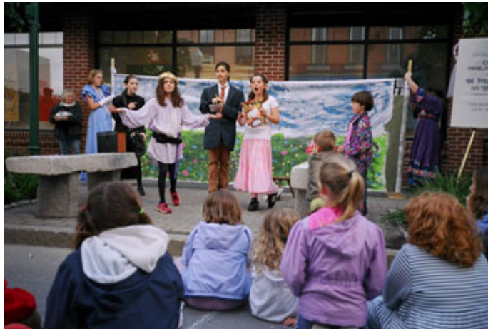
The Traveling Theatre of Midcoast Family Theatre Company performs on Main Street at the Rockland Summer Solstice Festival