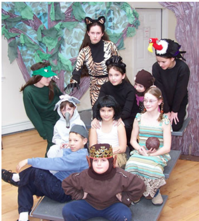
JUNGLE BOOK, Seaglass Kids March production: Cast photo

Another recent children's production was THE WIZARD OF OZ, which ran at Windham Center Stage , Windham, ME, March 3 – 5 and 10 – 12.