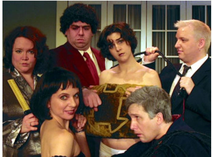
The Cast Of COMMUNICATING DOORS, The Originals