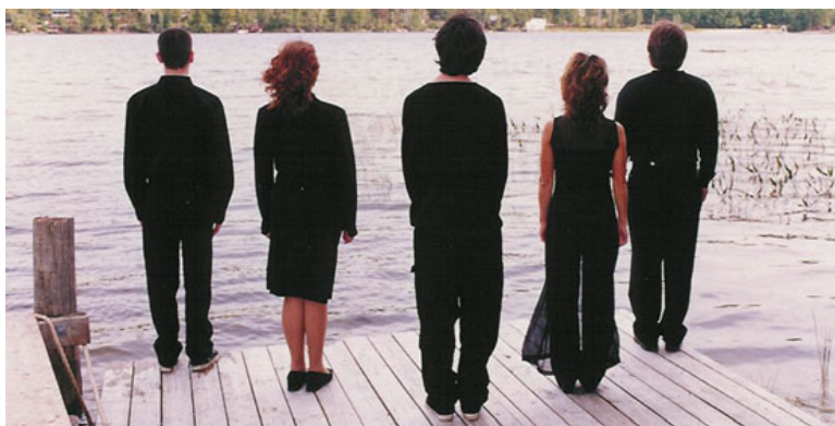
WINGNUTS, Comedy Improv Group, King's Bridge Theatre

All information is up to date as of press time. CAST & CREW suggests you call to confirm.