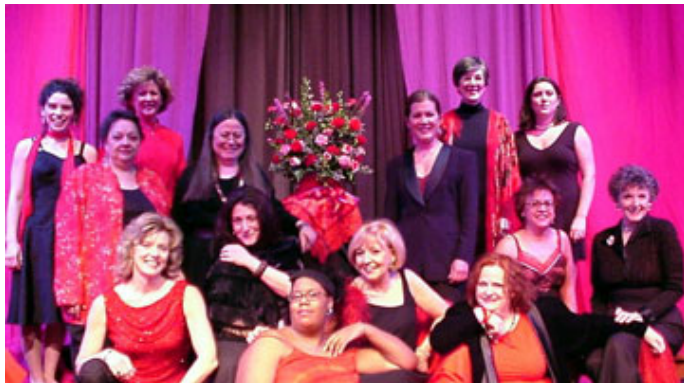
Cast of THE VAGINA MONOLOGUES , Girl Power Productions